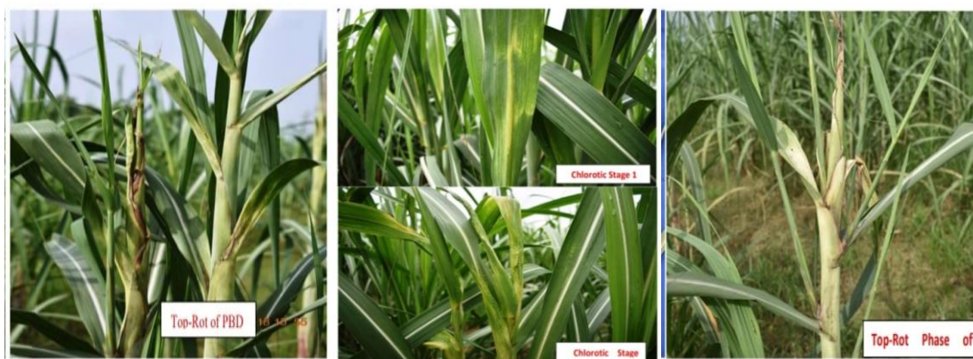
Fig.3: Chlorotic, Top-rot and Knife cut Symptoms of PBD in sugarcane.