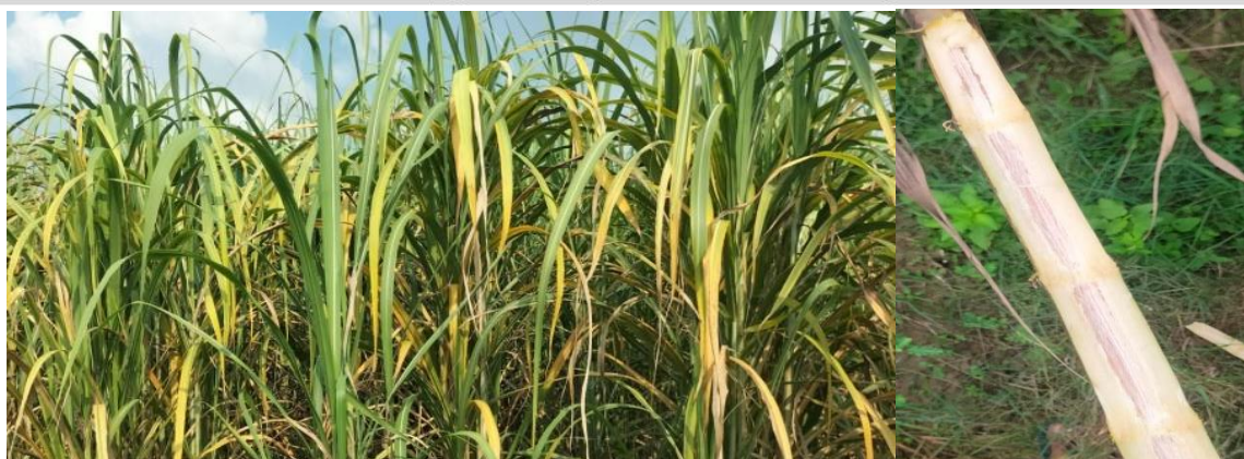
Fig.3: Symptoms of wilt, pre wilting symptoms yellowing of leaves and stalk infection.