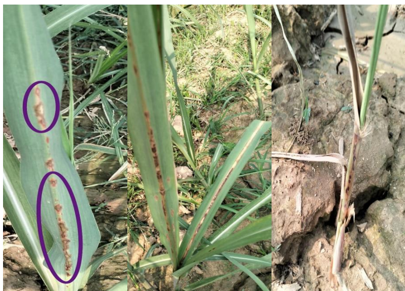
Fig.1: Primary symptoms of red rot; pearl like structures appear on the midrib of the leaf.

leaves of infected plant, round pearls like structures appear on the midrib of the infected plants can be easily seen, in the case of severe infection in primary stage whole plant die and 100 percent losses to the farmers and same condition in the case of sowing of contaminated seed sets of sugarcane, the pathogen attack on seed setts and taken the food materials from seed setts before the germination of the seed buds so that the seed buds killed and 100 percent losses in germination of seed buds. Characteristics symptom of the disease are seen after cane formation in the month of August- September.